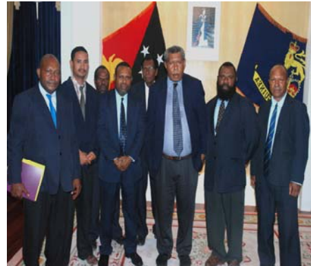
Swearing in ceremony of the new Chairman at the Government House