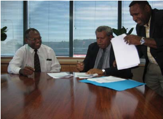
Signing of instruments of oath