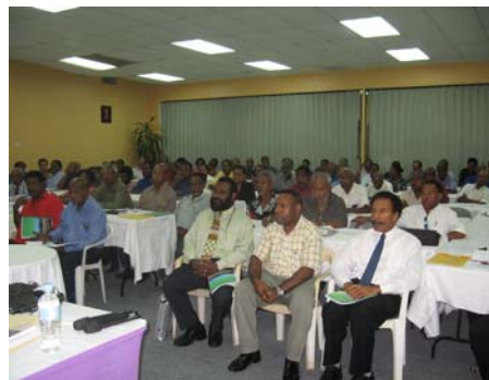
The Land Development Seminar was held at Granville Motel on the 30 th November 2007 to deliberate on the report.