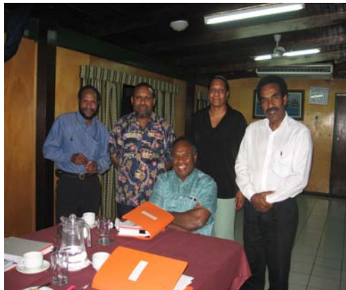
CLRC Commissioners Meeting Kokopo 28 th June 2007